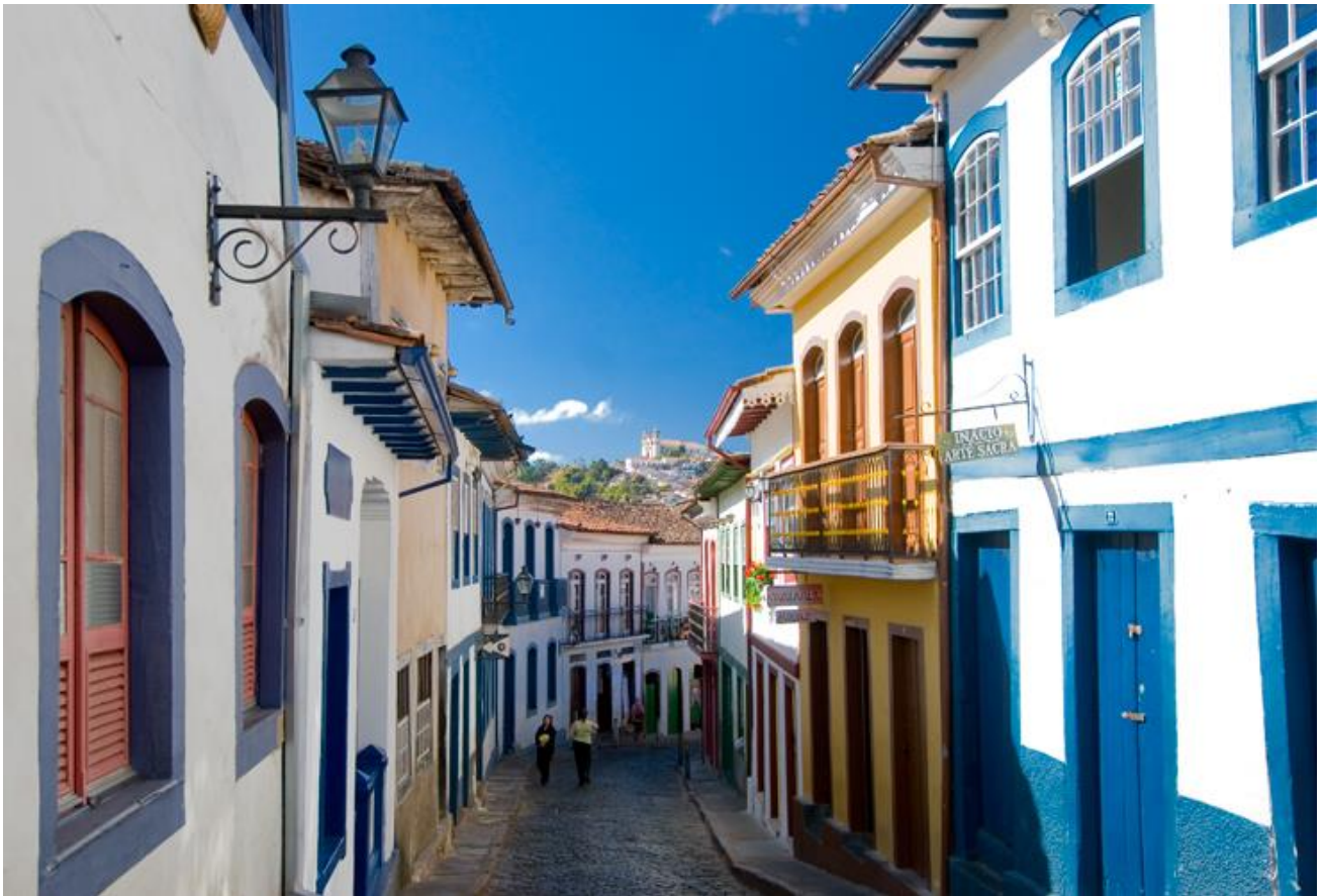
Ouro Preto and Inhotim, Minas Gerais, Brazil – 5 days.