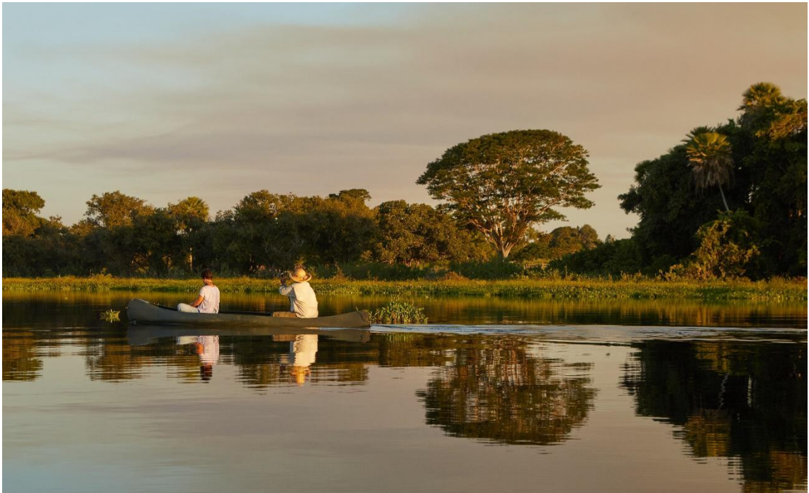
Canadian Canoe Tour