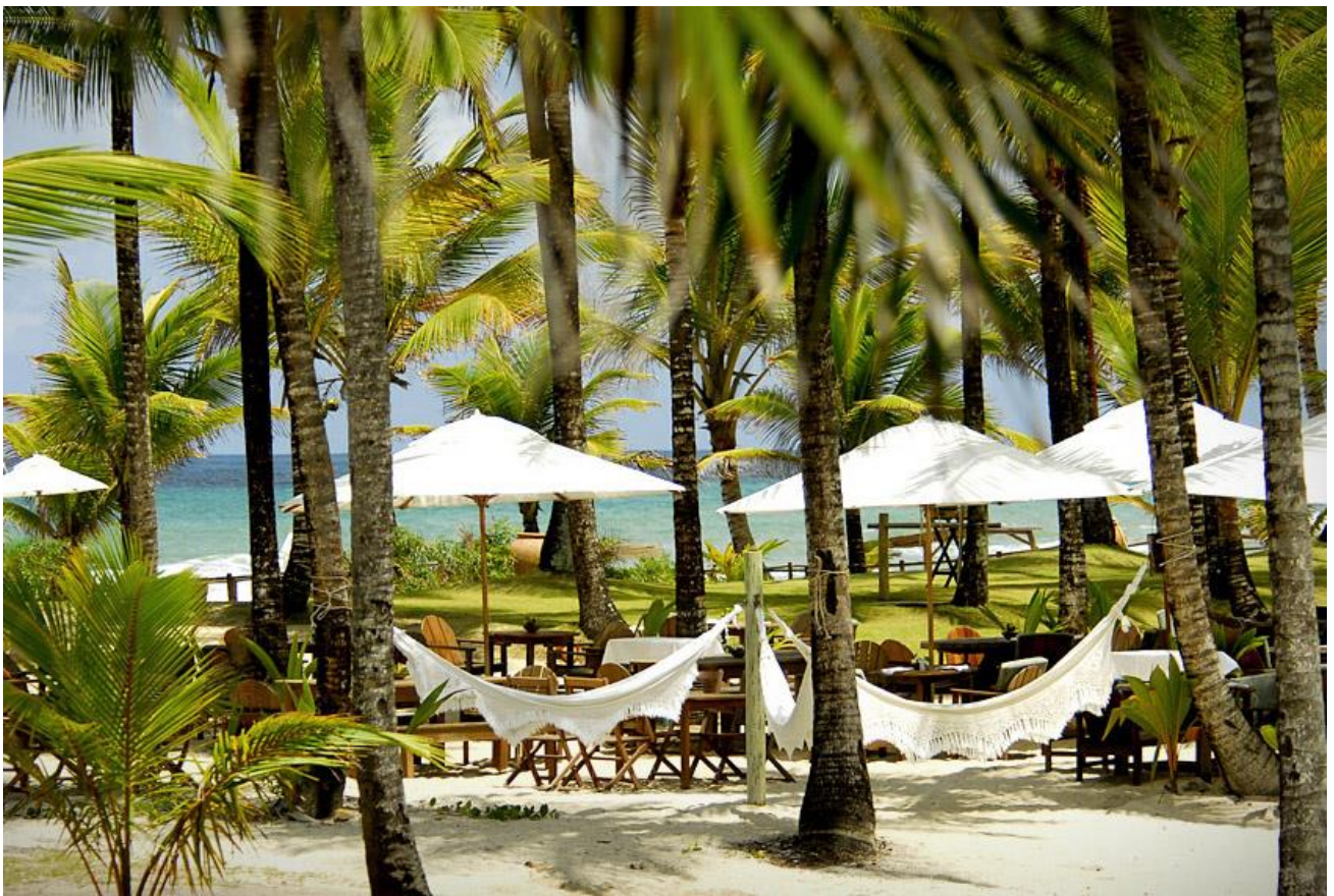
Itacaré, Bahia, Brazil.