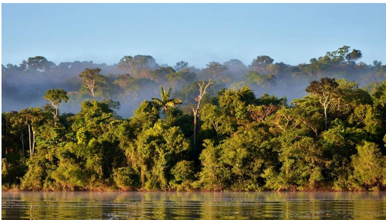
Alta Floresta, Mato Grosso, Brasil.